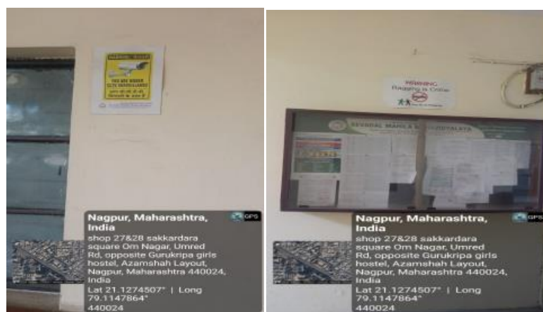
Display boards for anti-ragging and presence of CCTV Surveillance camera different places in the college premises