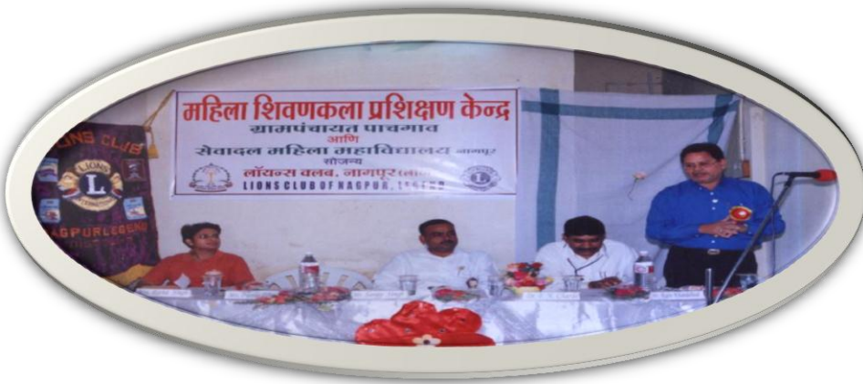
Inaugural Function of Sewing & Embroidery Training Center, Panchgaon.

The Sewing and Embroidery Training Centre was started at Panchgaon in the year of 2005-06 with the help of Lion's club, Nagpur Legend and Panchgaon Grampanchayat. Dept. Of Textile and Clothing of Sevalal Mahila Mahavidyalaya, Nagpur, took initiative to train women of panchgaon village. For that the college had adopted the village Panchgaon for their social and economical development. As far as the economical development is concern, the college has planned to run this project for economically weaker women. The idea of establishing a training center is to provide the training to poor girls and women. In order to carry this process, we were committed ourselves to building a good faculty base. For this process we developed a memorandum of understanding with the Grampanchayat of Panchgaon village.