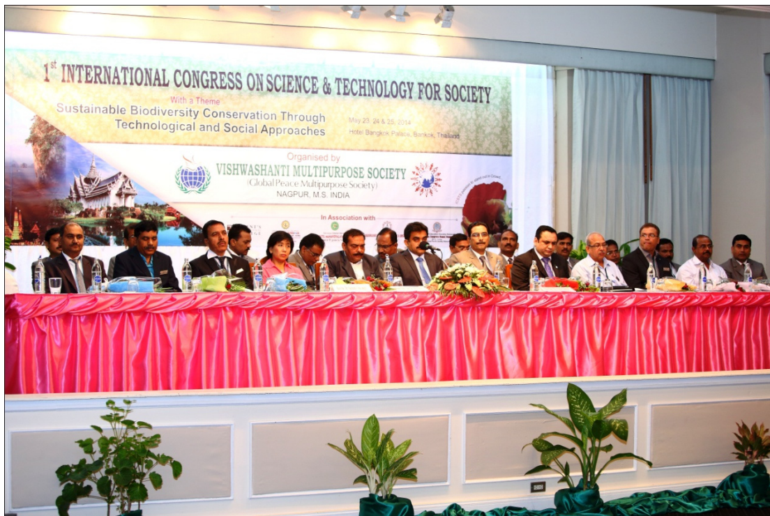
Inaugural Function of Conference