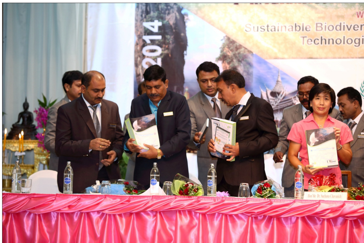
Release of Journal "IJRBAT" & "IJRSSIS"