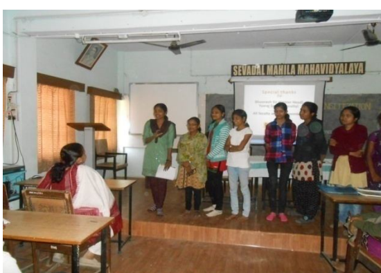
Participants presenting their views