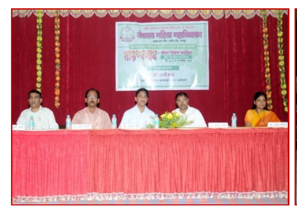
Hon'ble dignitaries on the dais during inaugural function