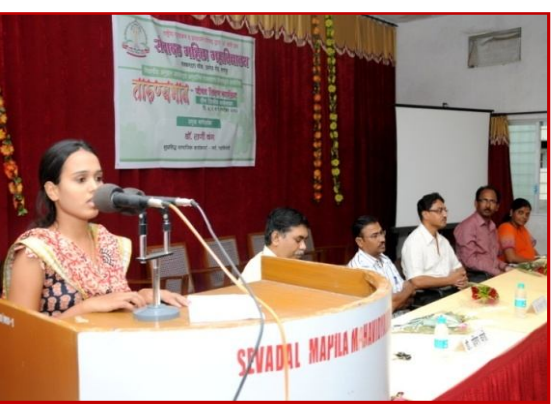
Participant presenting their feedback of Three Days Workshop