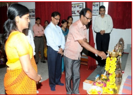
Hon'ble Guests lightening the traditional lamp