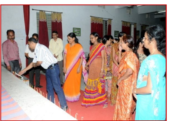
Lightening the Symbolic 'Dnyan Jyot' in Valedictory Function