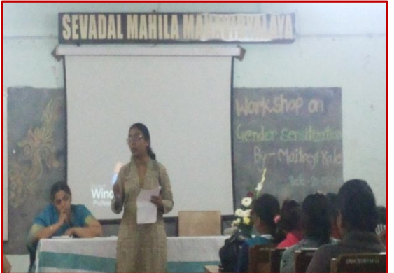
Group Leader presenting the views of their groups