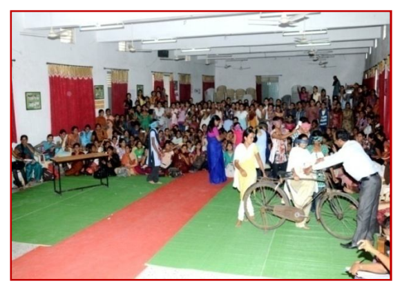
Participants enjoying the Game of Obstacles

In this session, the students were divided into groups of ten each. Group leaders were selected from each group and only they were instructed about what to do next. In this game, every group leader was instructed to apply a strip of cloth on every members eyes and was asked to lead them. Through this game the leadership qualities, coordination among members were taught.